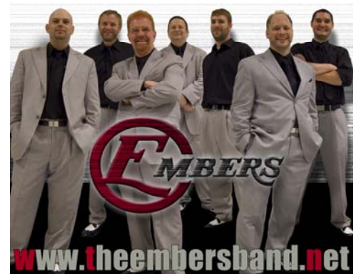
Sponsored by Victory Packaging

Casual dress and comfortable shoes will be needed for this night because attendees will be shagging to NC's premier beach music band, The Embers . Bring your loafers and shagging shoes and carefully pick your dance partner, because you could win the NCMA's Best Shagging Couple Contest . Click here to see video of The Embers and get some shagging pointers.