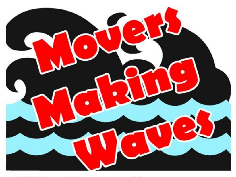
64TH ANNUAL CONVENTION OCTOBER 11-13 WRIGHTSVILLE BEACH