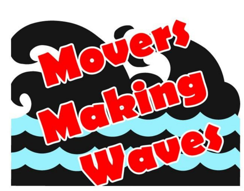
64TH ANNUAL CONVENTION OCTOBER 11-13 WRIGHTSVILLE BEACH

Plan are coming along for the 64th Annual Convention and Trade Show. We're going back to the Holiday Inn Resort at Wrightsville Beach.