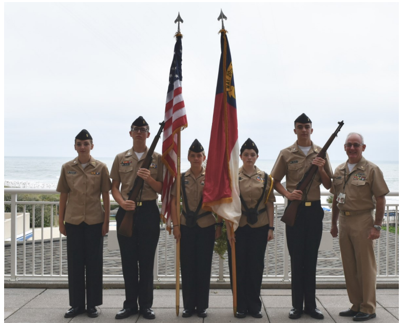
Ashley High School Junior Naval ROTC Honor Guard