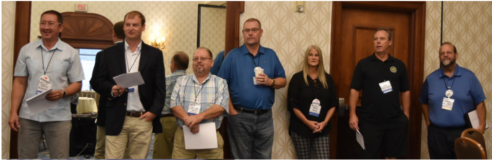
NCMA Board of Directors Preparing To Give Their Annual Reports to Membership