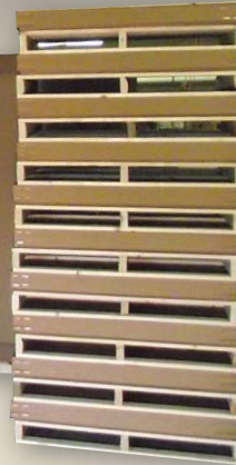
10 high for shipment